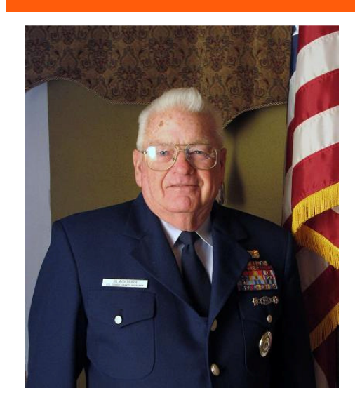
FROM THE QUARTERDECK (continued from page 1)

This February 18 & 19 the PCA, Past Commander's Association, will be held at